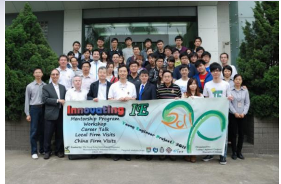
Group photo of the technical visit group

https://picasaweb.google.com/111225544025147025713/ChinaFirmVisit2011?feat=directlink