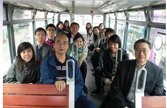
IIE (HK) group on a newly built tram

In this visit, our group has witnessed the impressive engineering capability of Tramways. It was a valuable experience for our members