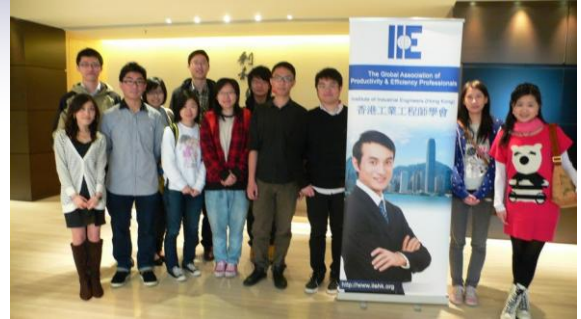
Participants enjoyed warm greeting by IDS staff