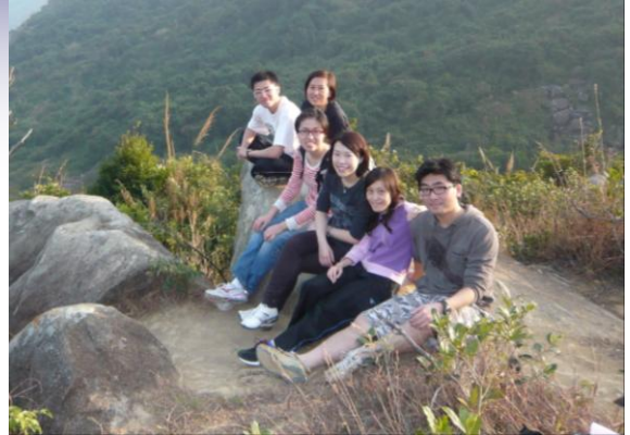
IIE (HK) Exco team went hiking

https://picasaweb.google.com/112301100086368393054/Exc_oHikingActivity?authkey=Gv1sRgCOXGgJX56pPLOA