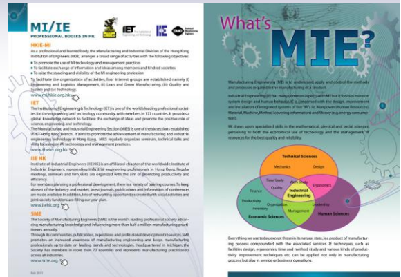
Joint societies promotion leaflet

http://www.iiehk.org/2011/05/joint-mie-societies-promotion-leaflet/