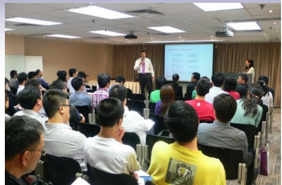
PM Seminar Series – Project Risk (Safety) Management on 16 th May 2011

Please email heman.hui@iiehk.org for registration of the 2 nd seminar, seats are allocated on a first come, first serve basis.